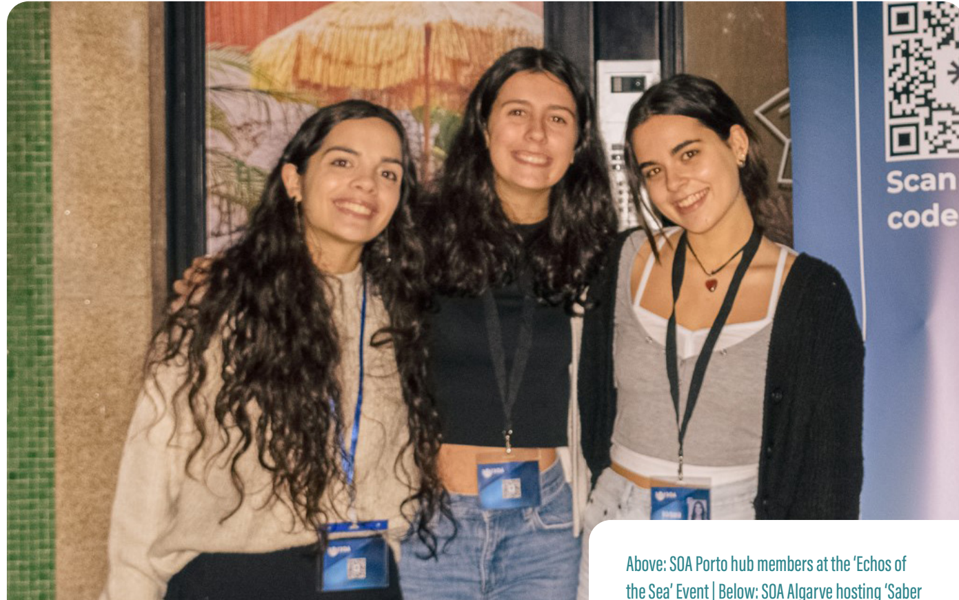
Above: SOA Porto hub members at the 'Echos of the Sea' Event | Below: SOA Algarve hosting 'Saber A Mar' ocean education and outreach event with local school children