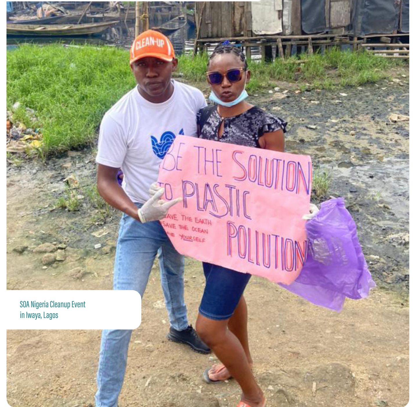
SOA Nigeria Cleanup Event in Iwaya, Lagos