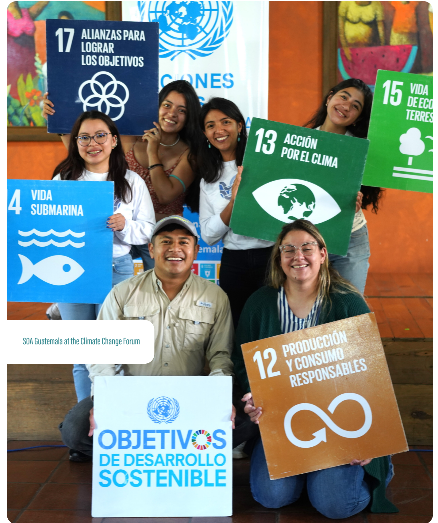
SOA Guatemala at the Climate Change Forum

On World Water Day (March 22), SOA Mexico and EarthEcho International organized an event with over 70 participants to identify ways to improve the health of their local water resources.