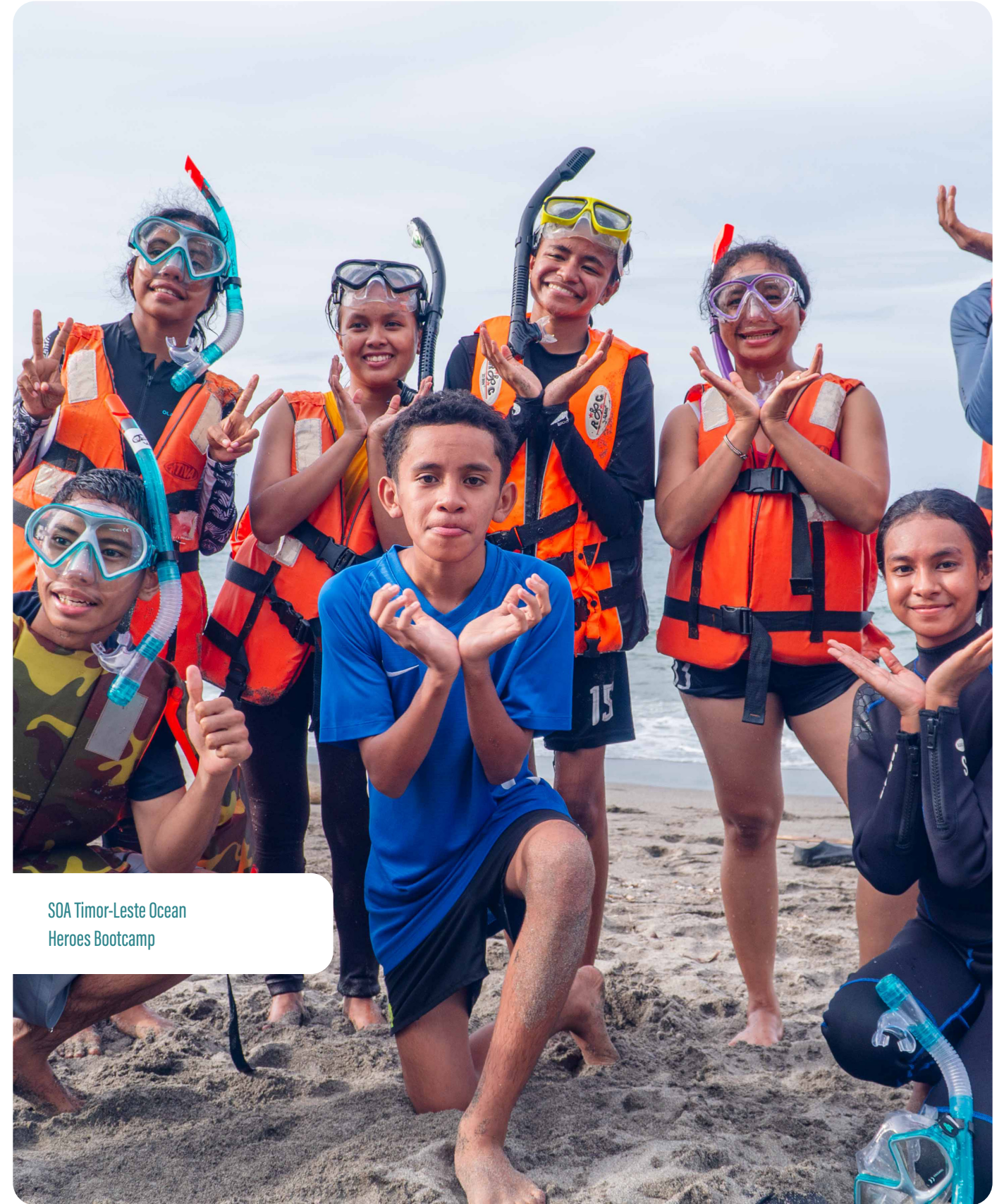
SOA Timor-Leste Ocean Heroes Bootcamp

SOA Timor-Leste organized a three-day Ocean Heroes Bootcamp to increase awareness and understanding of ocean conservation for local high school students. Through a variety of engaging and interactive activities—including mangrove restoration and sea turtle conservation—30 participants were educated and empowered around the global significance of the ocean, the threats it faces, and actionable steps to take to protect it.