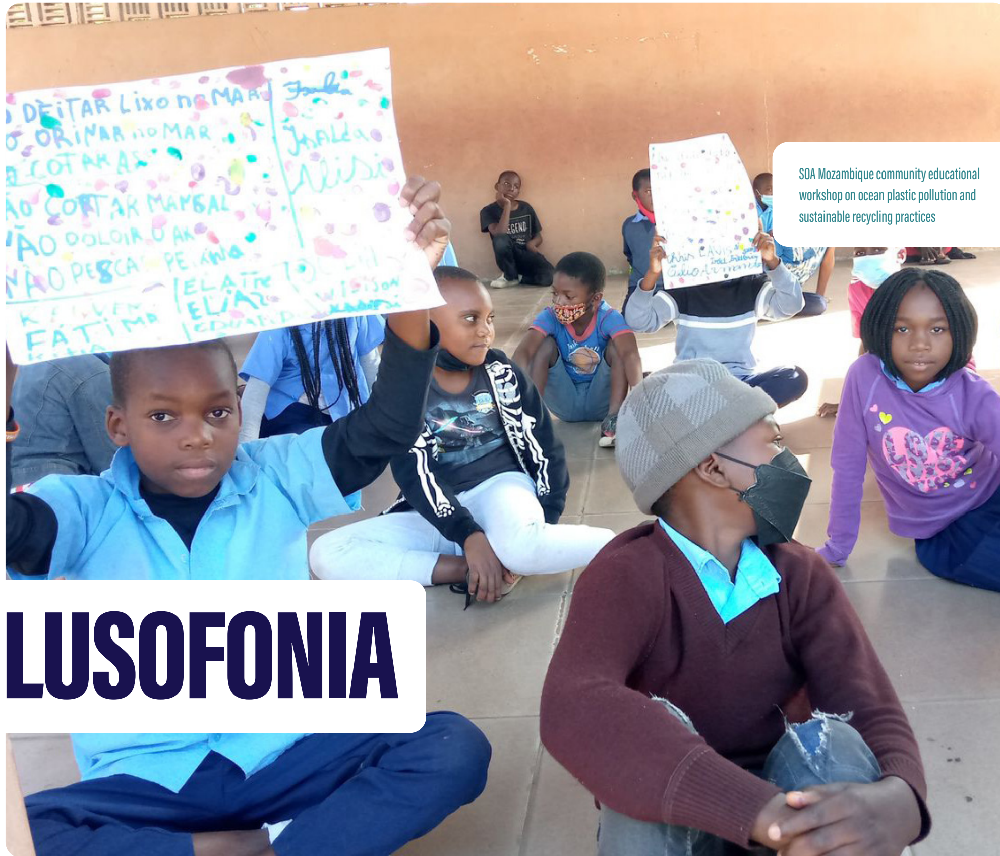
SOA Mozambique community educational workshop on ocean plastic pollution and sustainable recycling practices