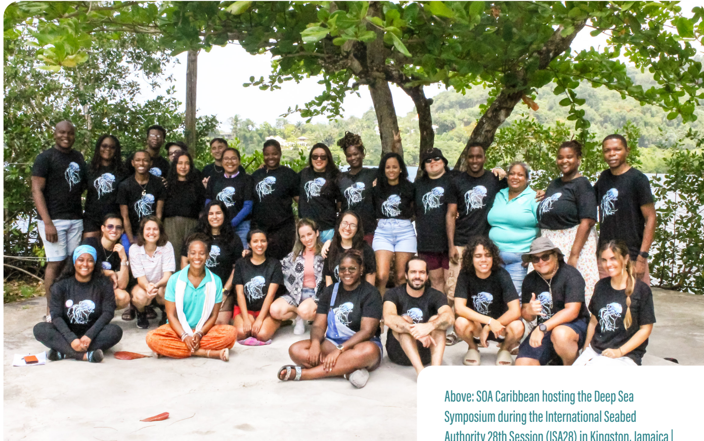
Above: SOA Caribbean hosting the Deep Sea Symposium during the International Seabed Authority 28th Session (ISA28) in Kingston, Jamaica | Below: SOA Caribbean seagrass restoration workshop in Trinidad & Tabago | Right: SOA Caribbean Snorkel Day in St. Lucia