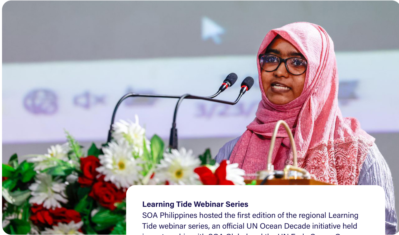
Above: SOA Sri Lanka Hub member speaking at COP 28 UAE