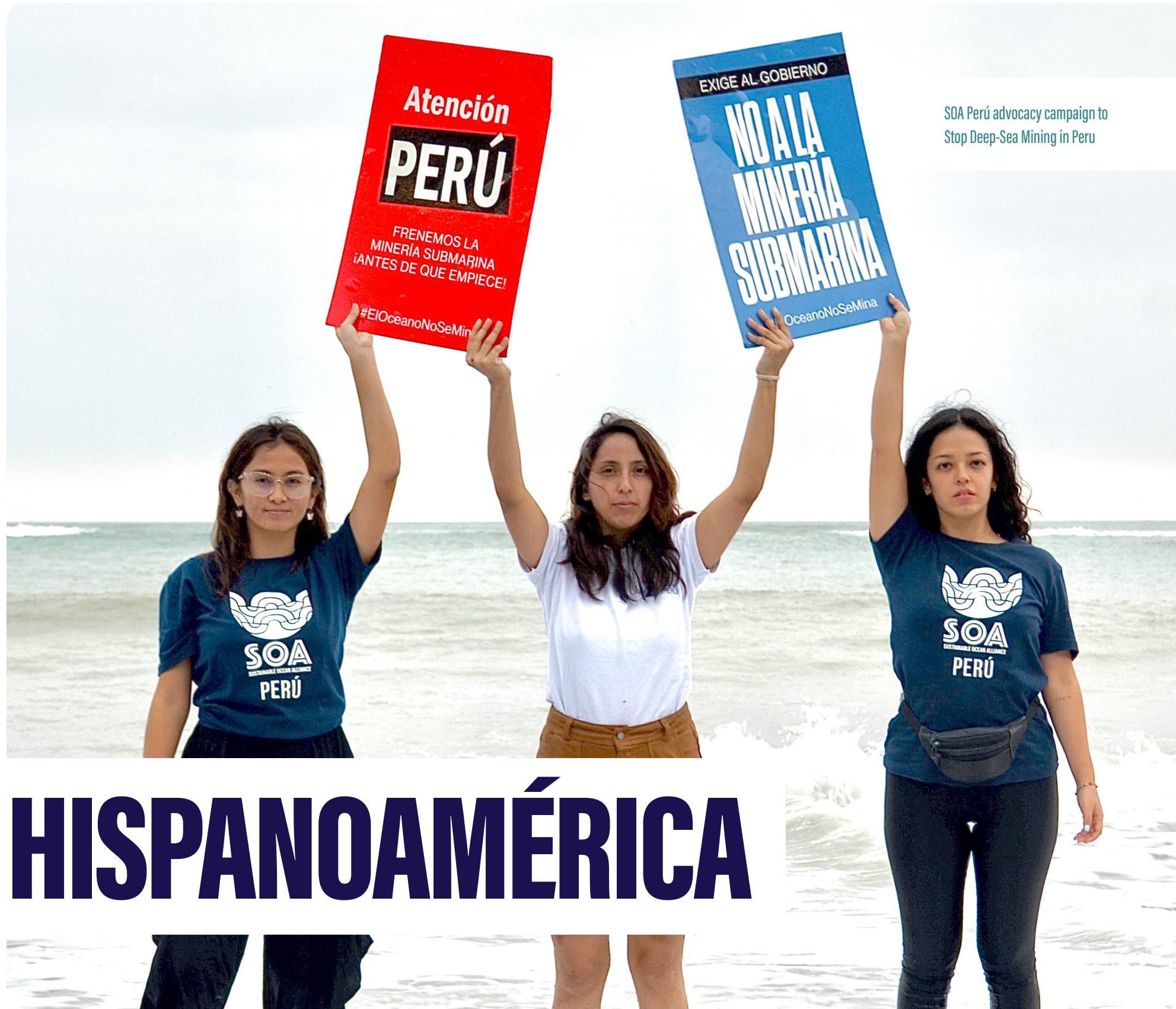
SOA Perú advocacy campaign to Stop Deep-Sea Mining in Peru