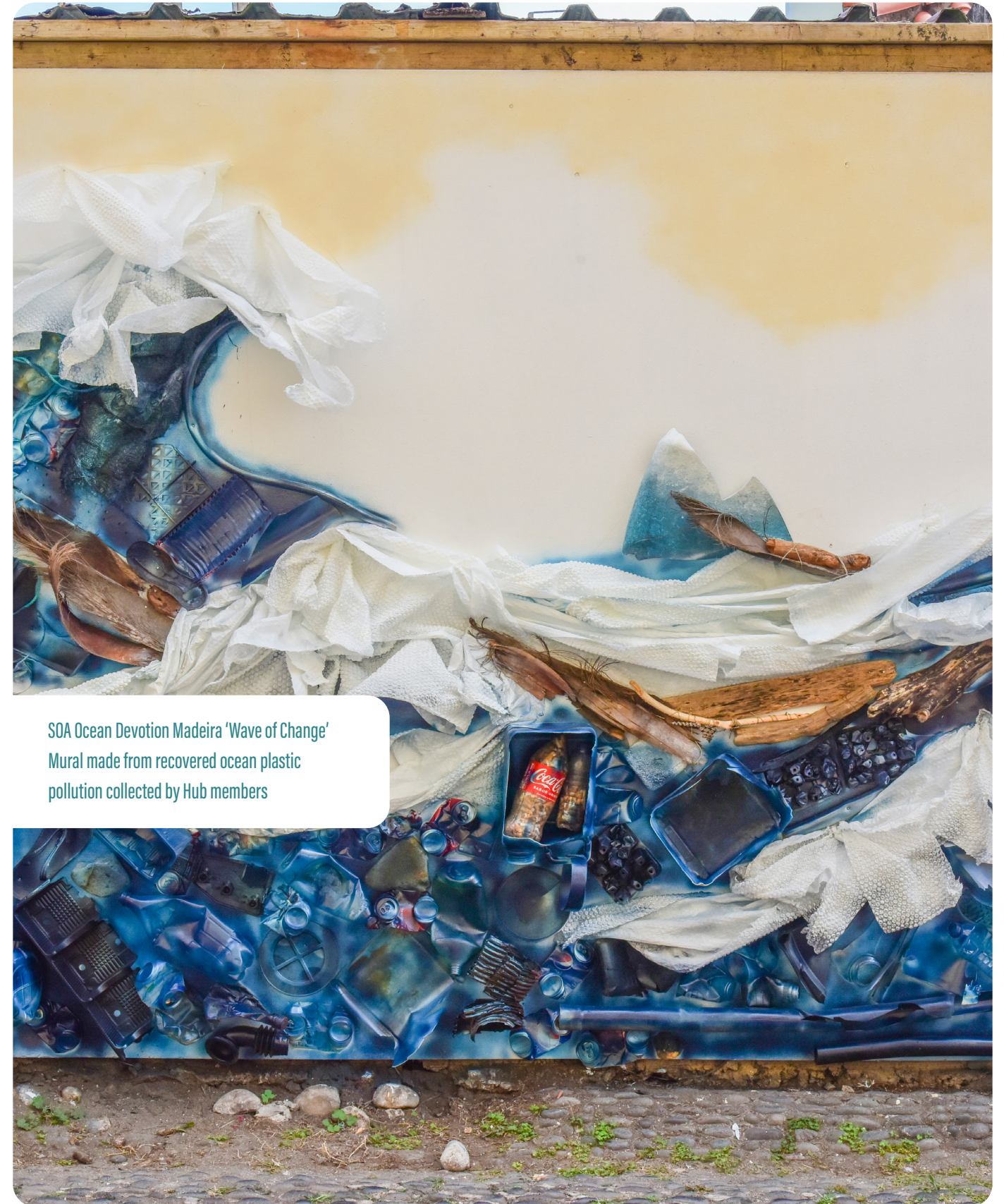
SOA Ocean Devotion Madeira 'Wave of Change' Mural made from recovered ocean plastic pollution collected by Hub members

Held in partnership with Heal & Growth, SOA Portugal organized the Mental Health & Ocean Workshop to explore how the ocean impacts mental health and human wellbeing.