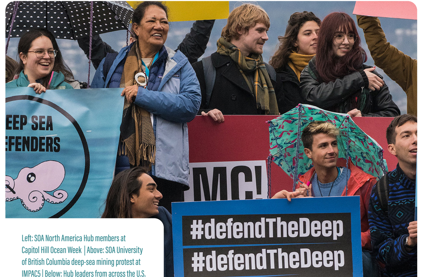
Left: SOA North America Hub members at Capitol Hill Ocean Week | Above: SOA University of British Columbia deep-sea mining protest at IMPAC5 | Below: Hub leaders from across the U.S. Carolinas region (SOA Charleston, SOA College of Charleston, SOA University of North Carolina Chapel Hill, and SOA Duke University) at the 2023 Hope Summit

CisternYard Media: 2023 Carolina Ocean Alliance hosts 2023 Hope Summit