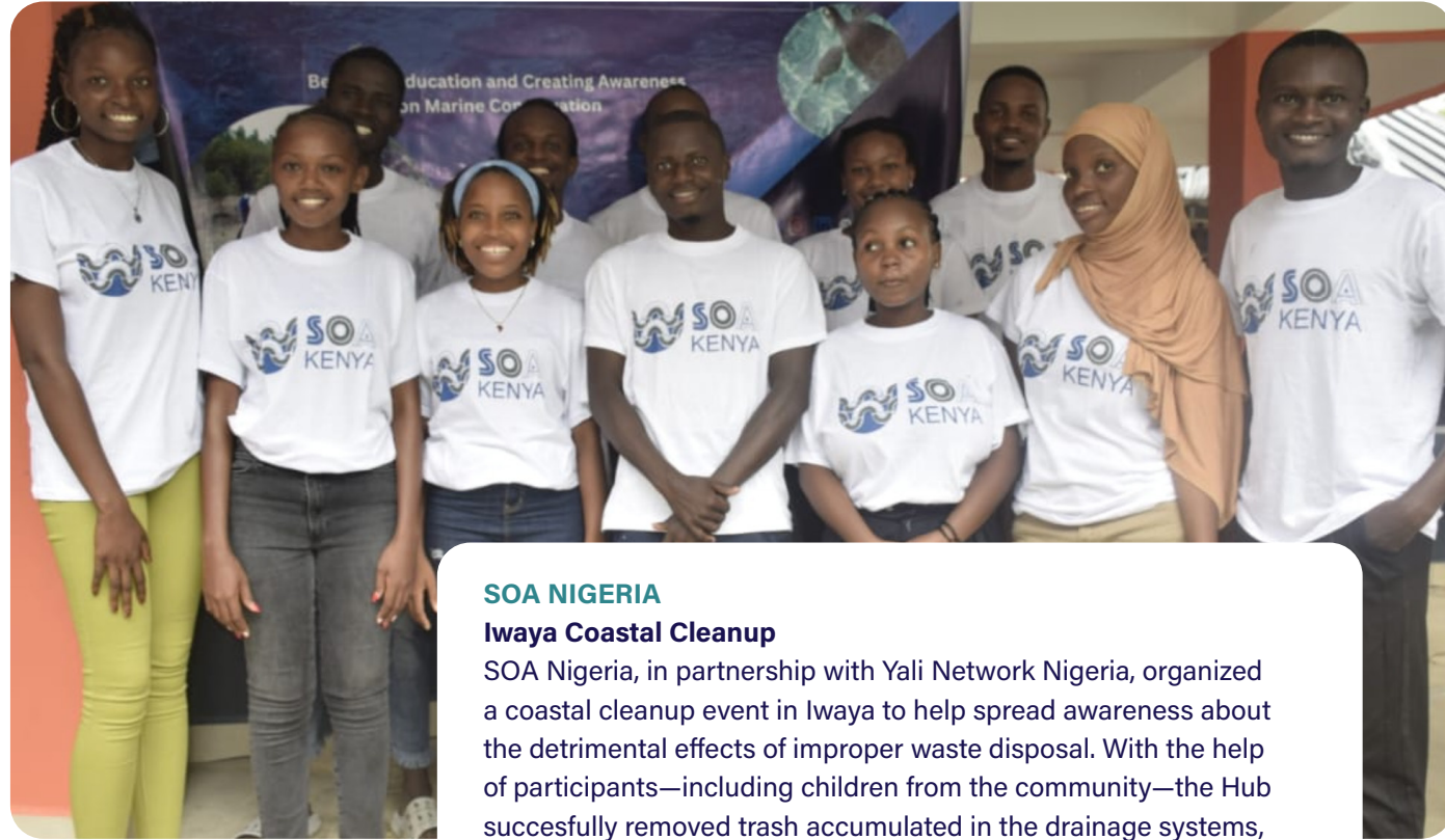
Above: SOA Kenya Blue Academy Program