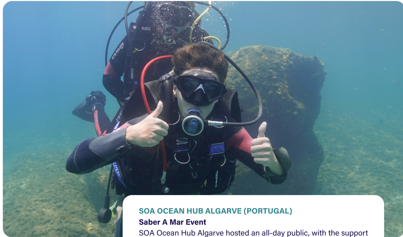
Above: Projeto TransforMAR scuba diving and educational activity with local low-income school children in Brasil