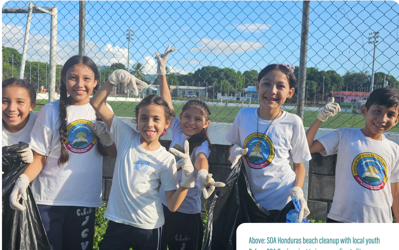
Above: SOA Honduras beach cleanup with local youth Below: SOA Perú project to improve climate literacy through schools in fishing communities