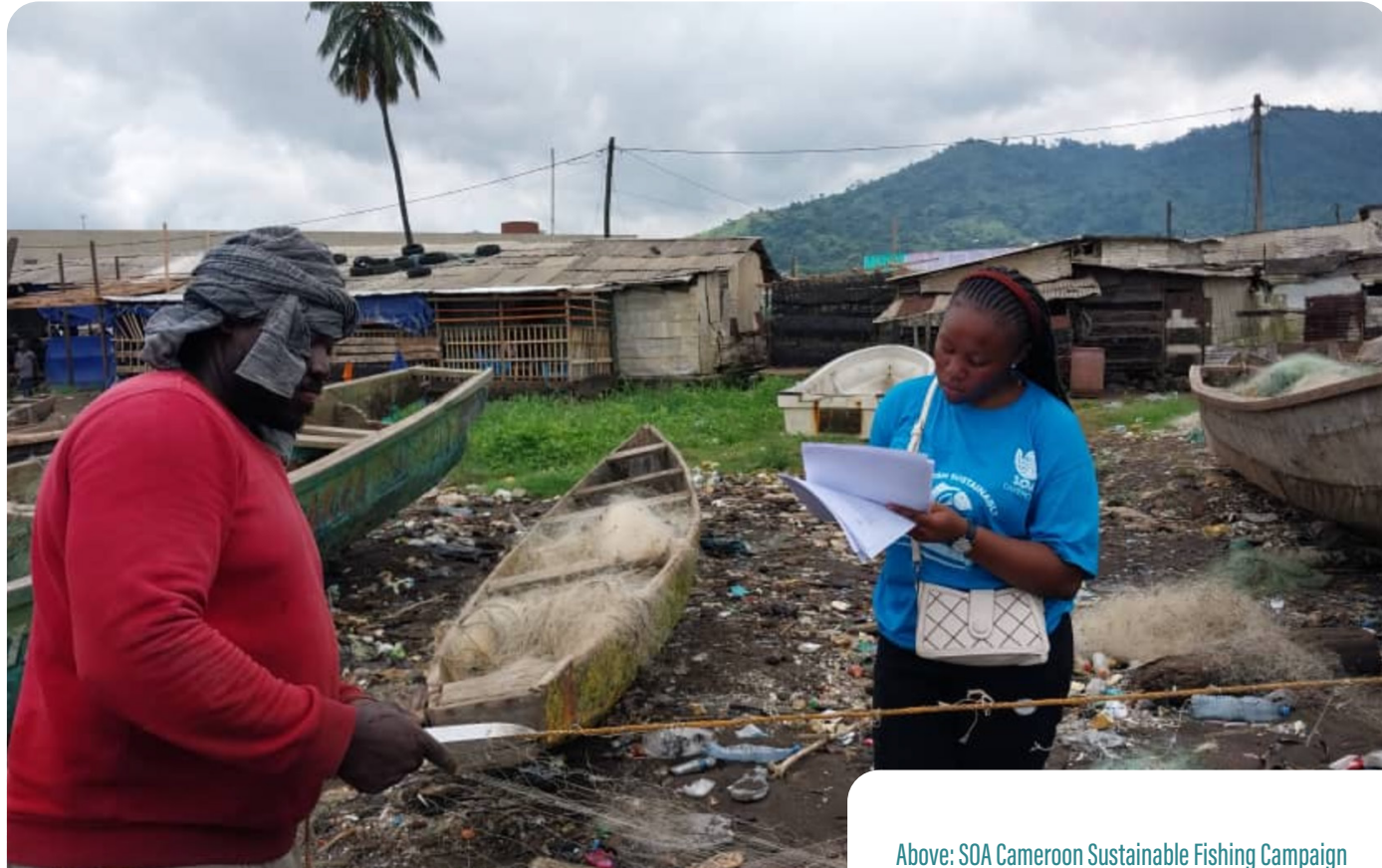
Above: SOA Cameroon Sustainable Fishing Campaign Below: SOA Zanzibar Mangrove Planting Event