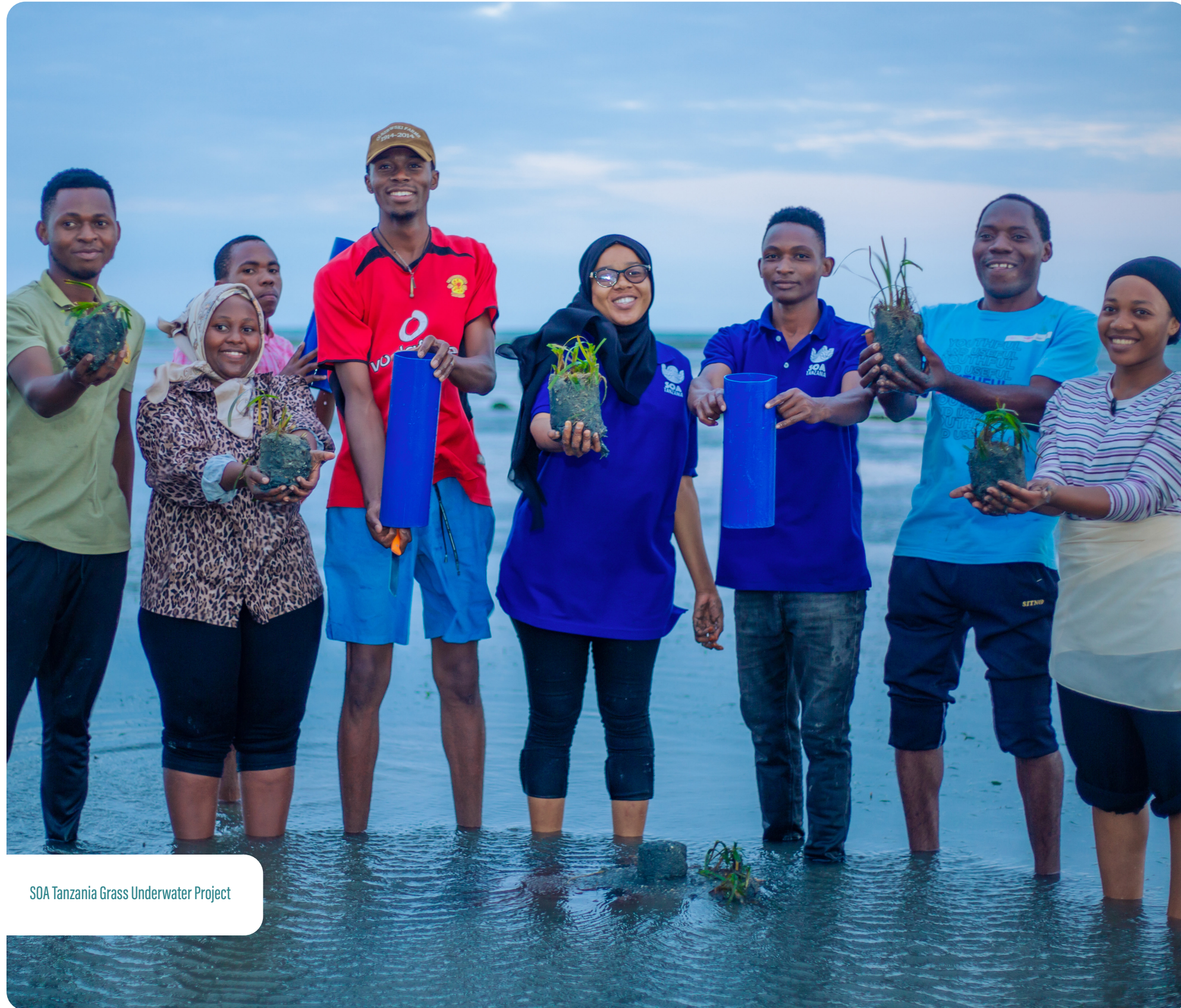
SOA Tanzania Grass Underwater Project