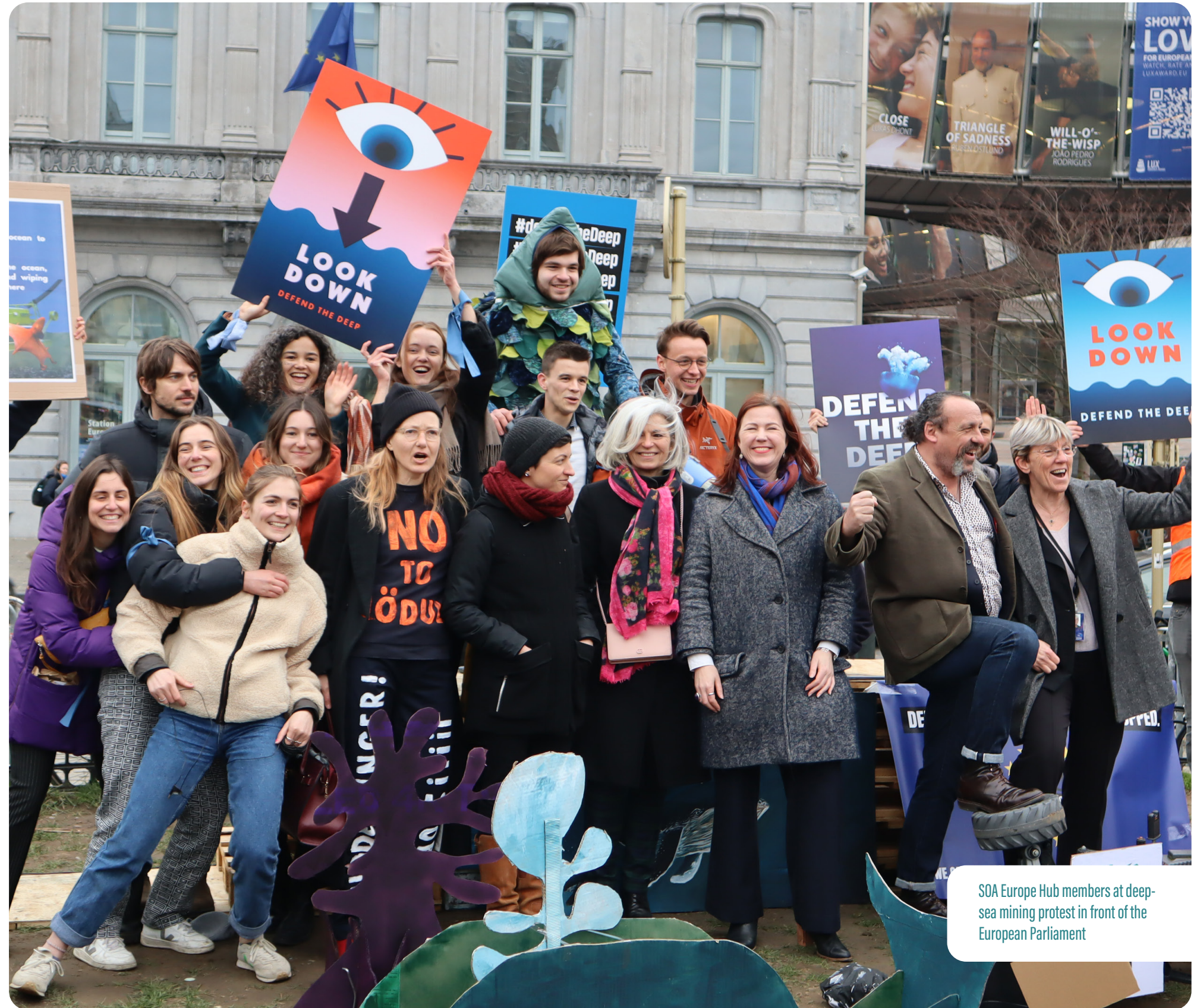
SOA Europe Hub members at deep-sea mining protest in front of the European Parliament

EXPLORE THE GLOBAL IMPACT OF SOA'S HUBS →